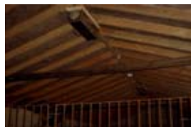
Stand Alone Unit